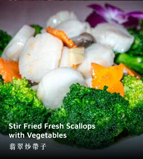
Stir Fried Fresh Scallops with Vegetables 翡翠炒帶子