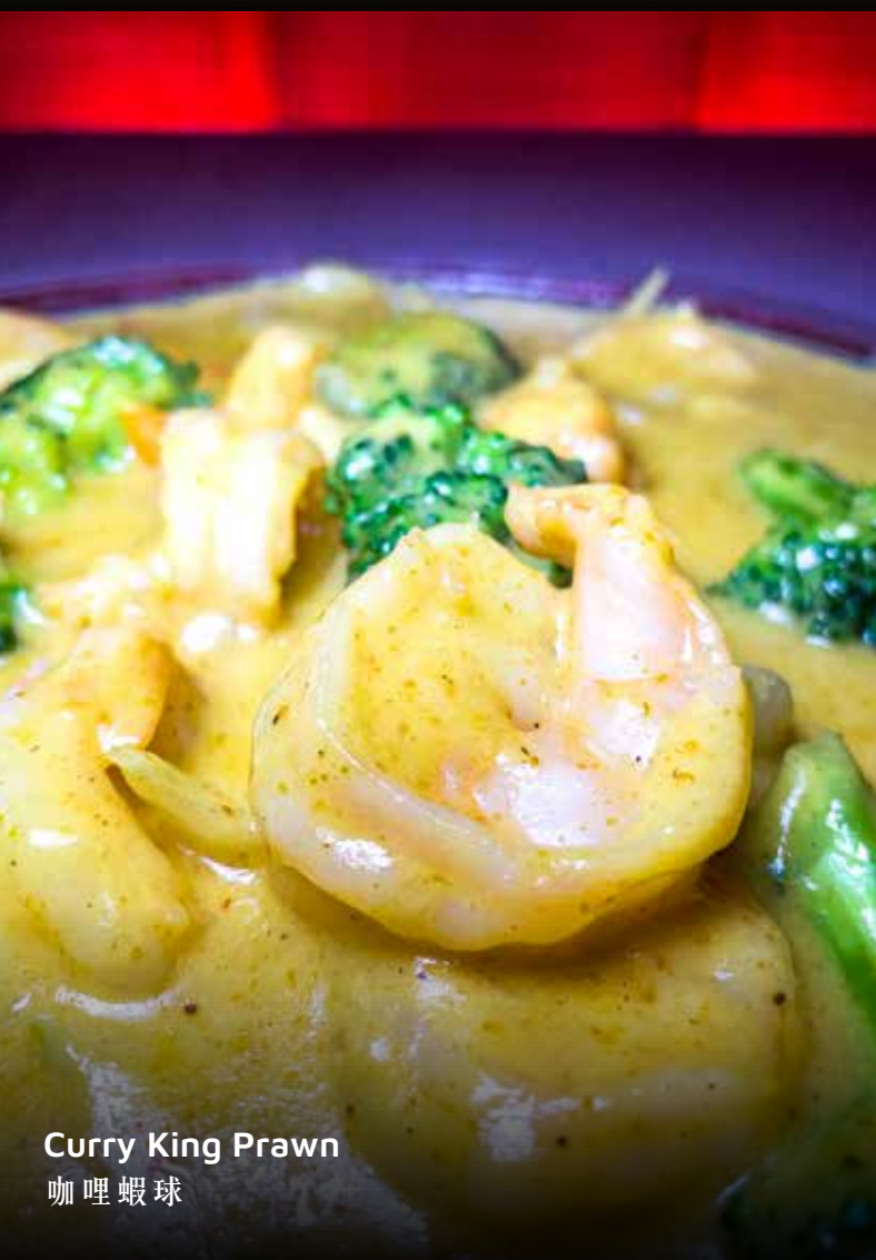
Curry King Prawn 咖哩蝦球