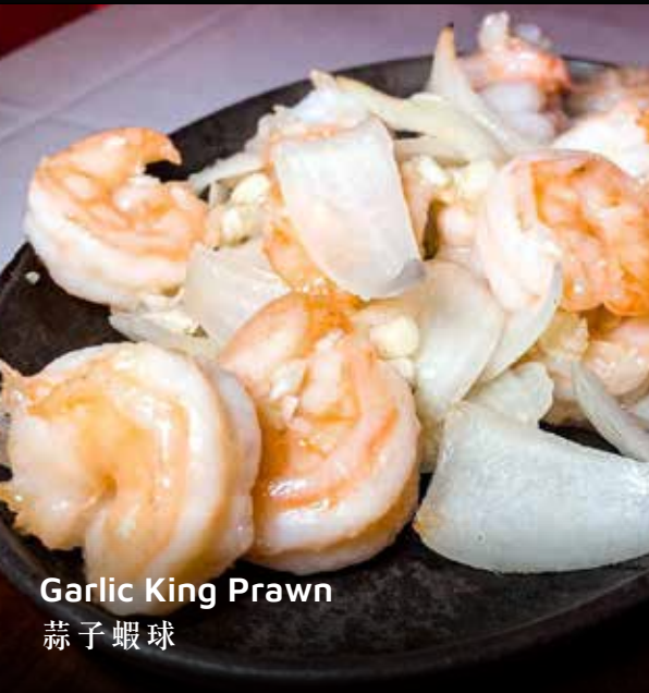
Garlic King Prawn 蒜子蝦球

Stir Fried Fresh Scallops with Vegetables $43.80 翡翠炒帶子