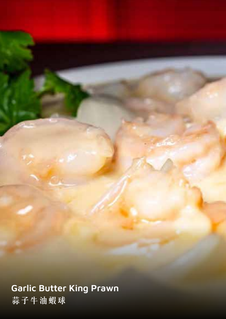
Garlic Butter King Prawn 蒜子牛油蝦球