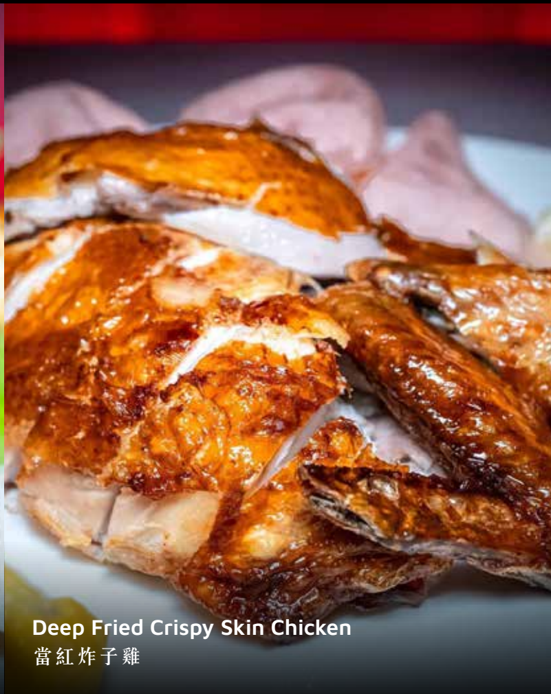
Deep Fried Crispy Skin Chicken 當紅炸子雞