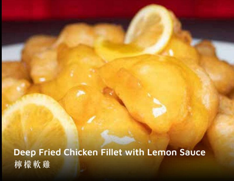
Deep Fried Chicken Fillet with Lemon Sauce 檸檬軟雞