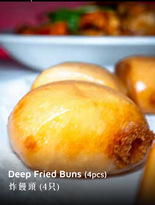
Deep Fried Buns (4pcs) 炸饅頭 (4只)