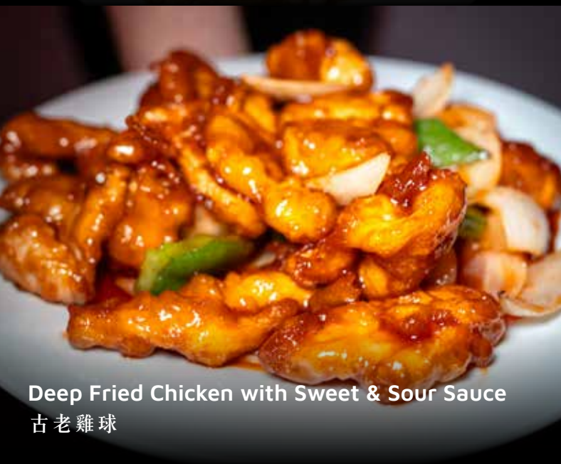
Deep Fried Chicken with Sweet & Sour Sauce 古老雞球