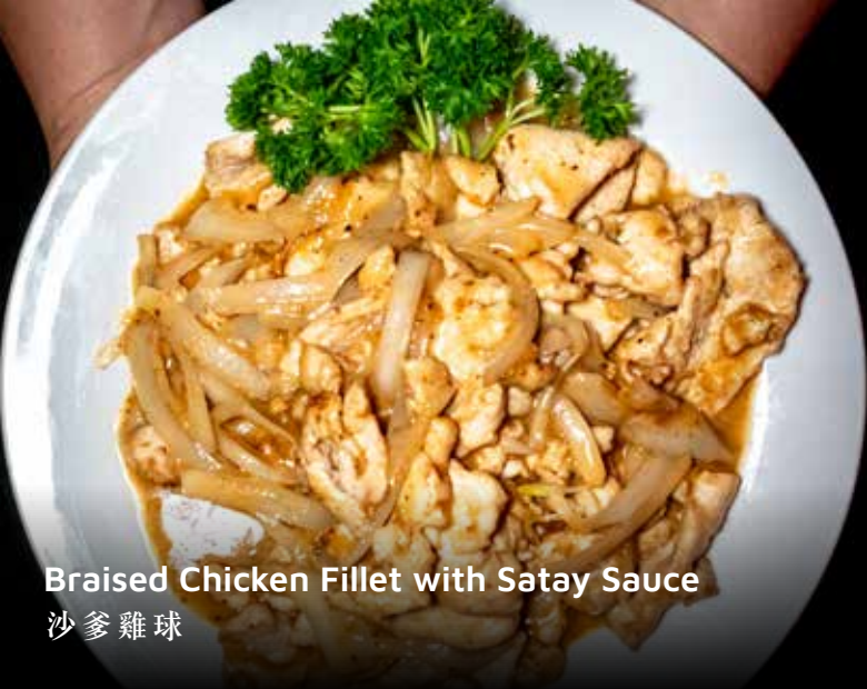
Braised Chicken Fillet with Satay Sauce 沙爹雞球