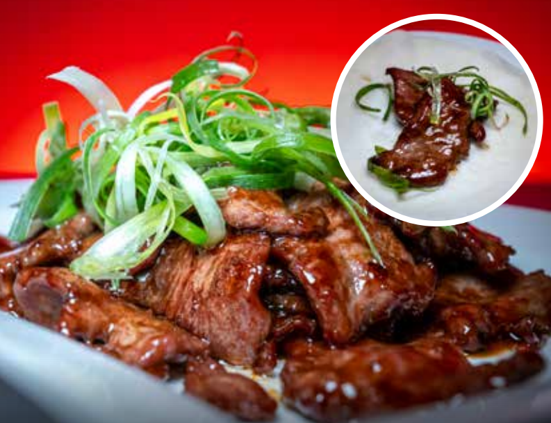
Mongolian Lamb Pancakes (6pcs) 蒙古羊肉薄餅 (6片)