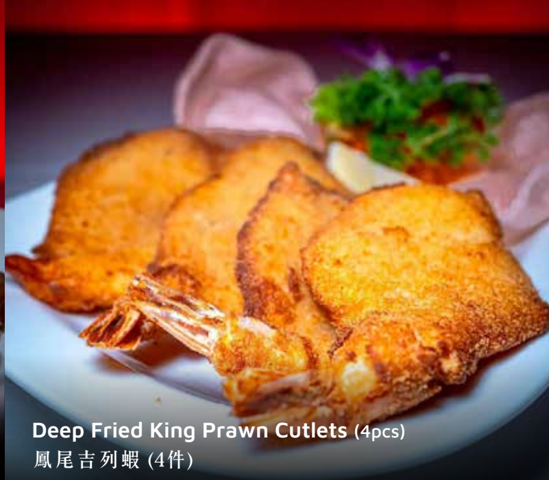
Deep Fried King Prawn Cutlets (4pcs) 鳳尾吉列蝦 (4件)