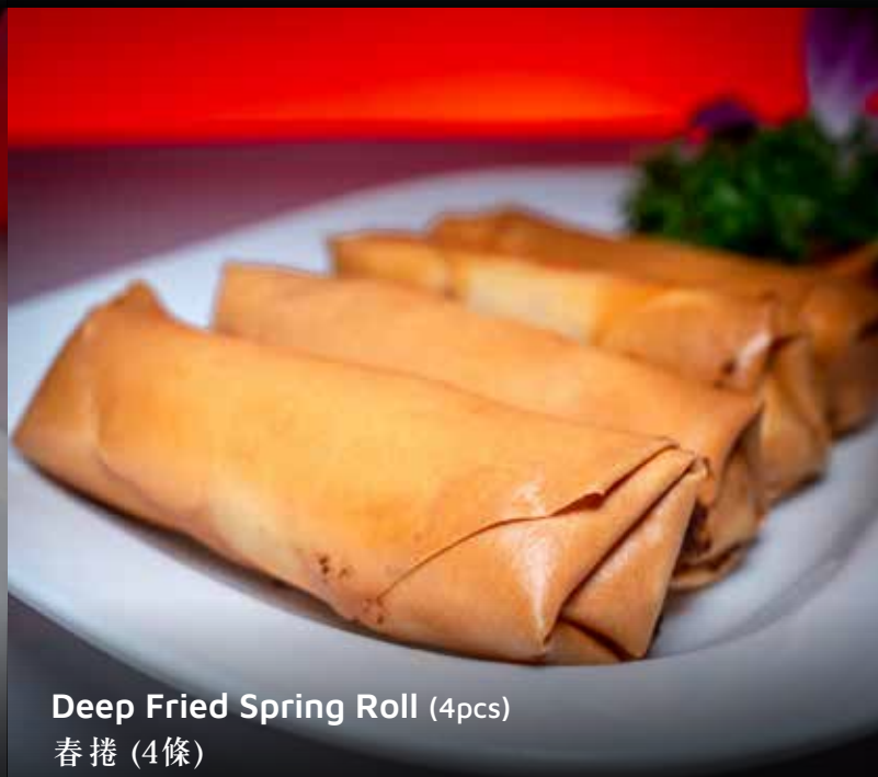
Deep Fried Spring Roll (4pcs) 春捲 (4條)