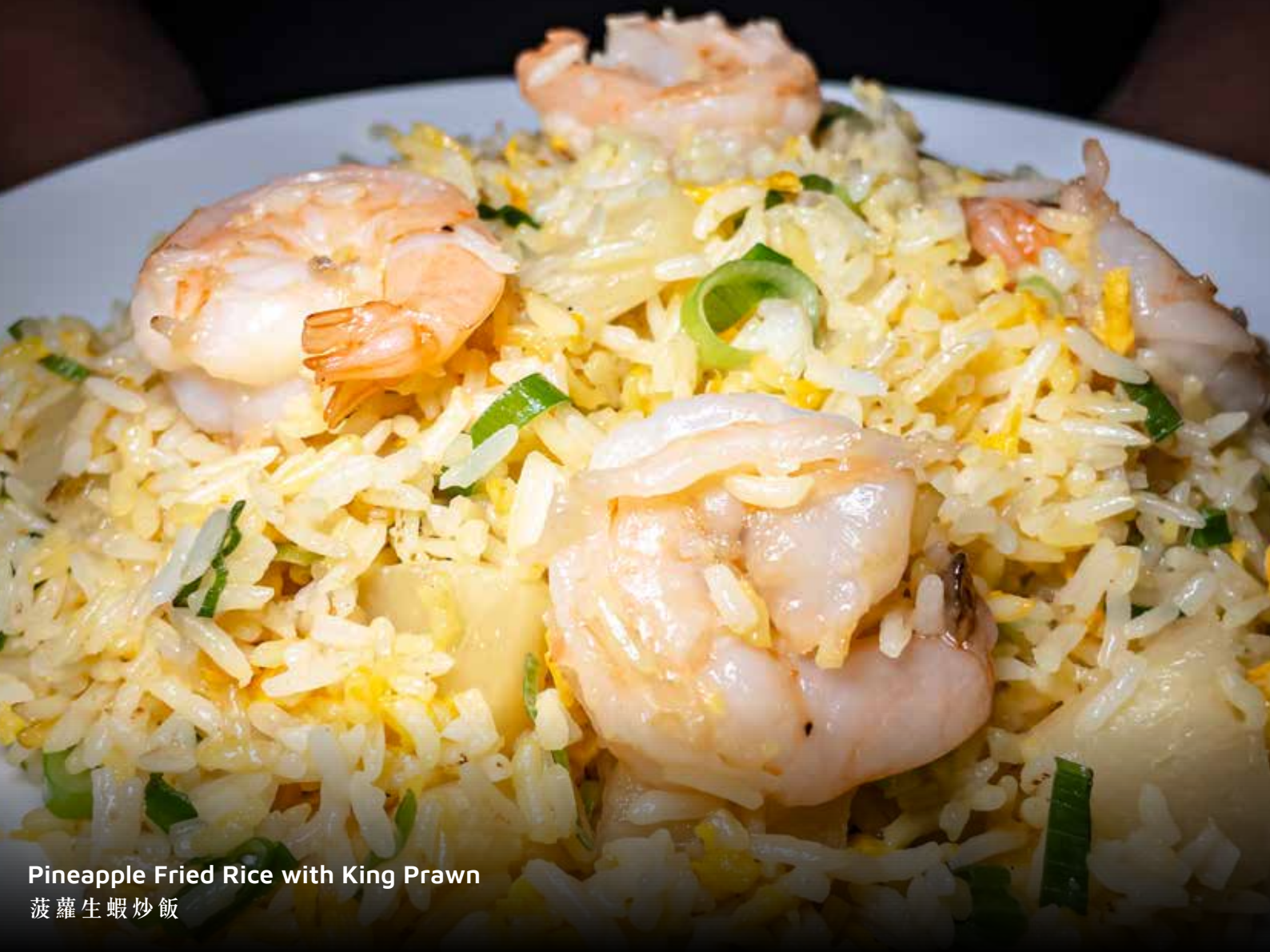
Pineapple Fried Rice with King Prawn 菠蘿生蝦炒飯