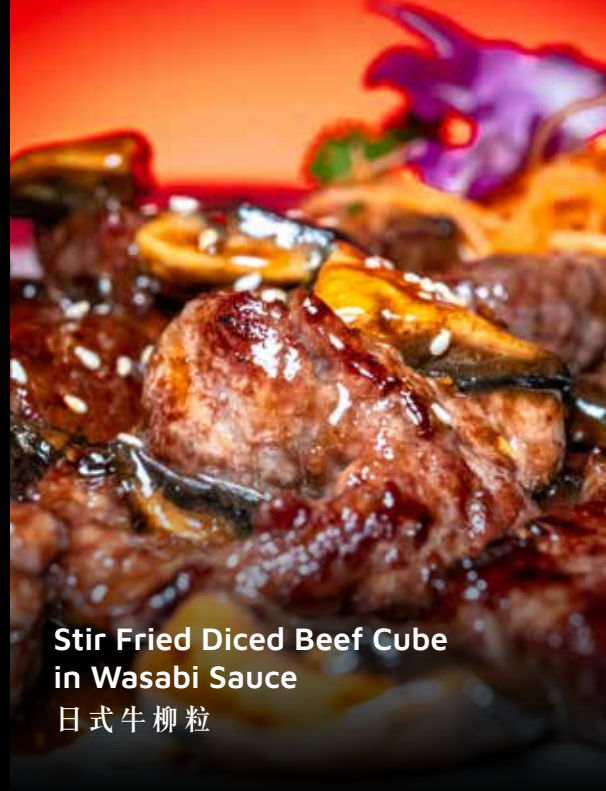
Stir Fried Diced Beef Cube in Wasabi Sauce