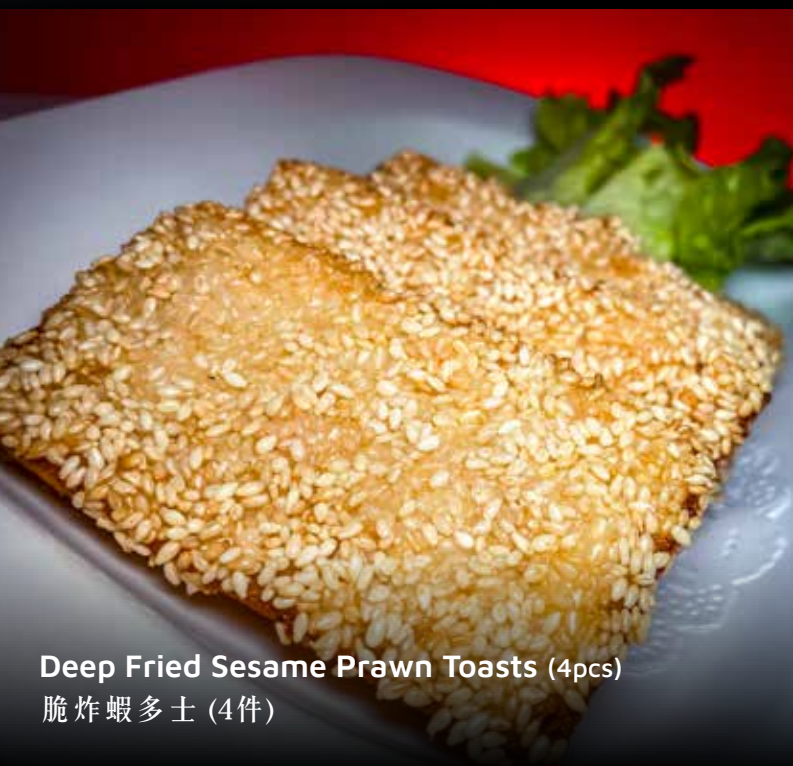
Deep Fried Sesame Prawn Toasts (4pcs) 脆炸蝦多士 (4件)