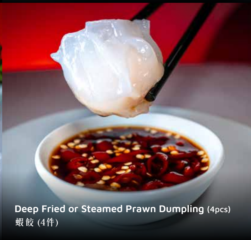
Deep Fried or Steamed Prawn Dumpling (4pcs) 蝦餃 (4件)