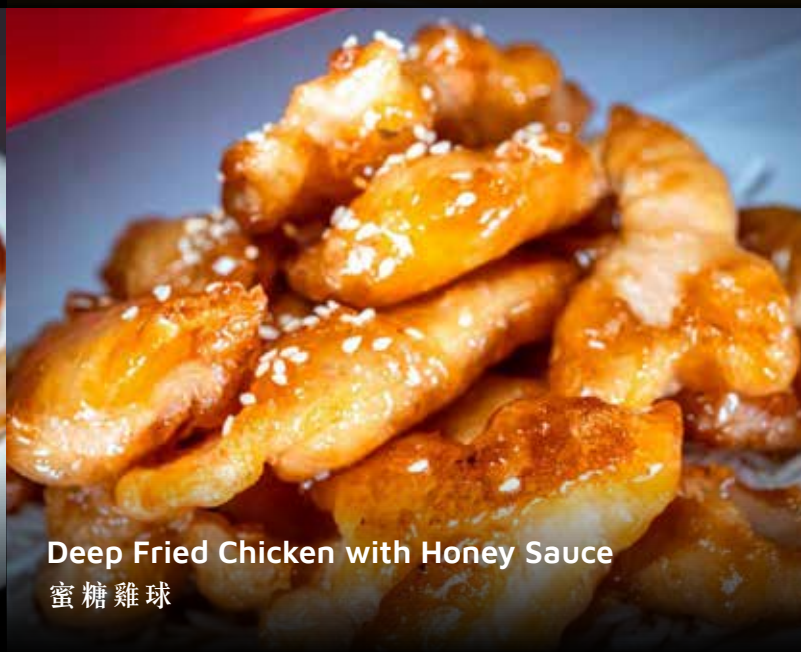
Deep Fried Chicken with Honey Sauce 蜜糖雞球