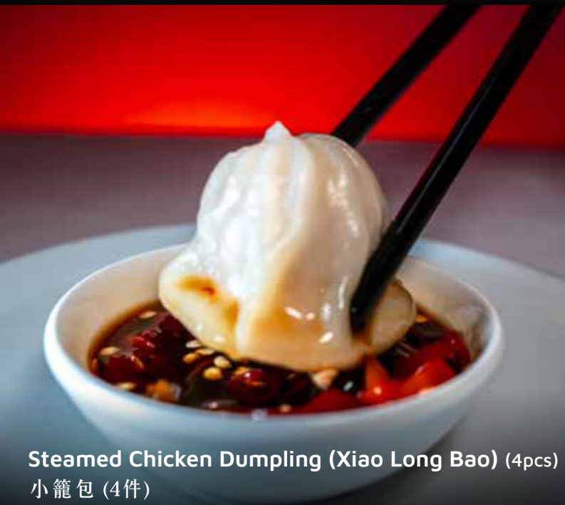
Steamed Chicken Dumpling (Xiao Long Bao) (4pcs) 小籠包 (4件)