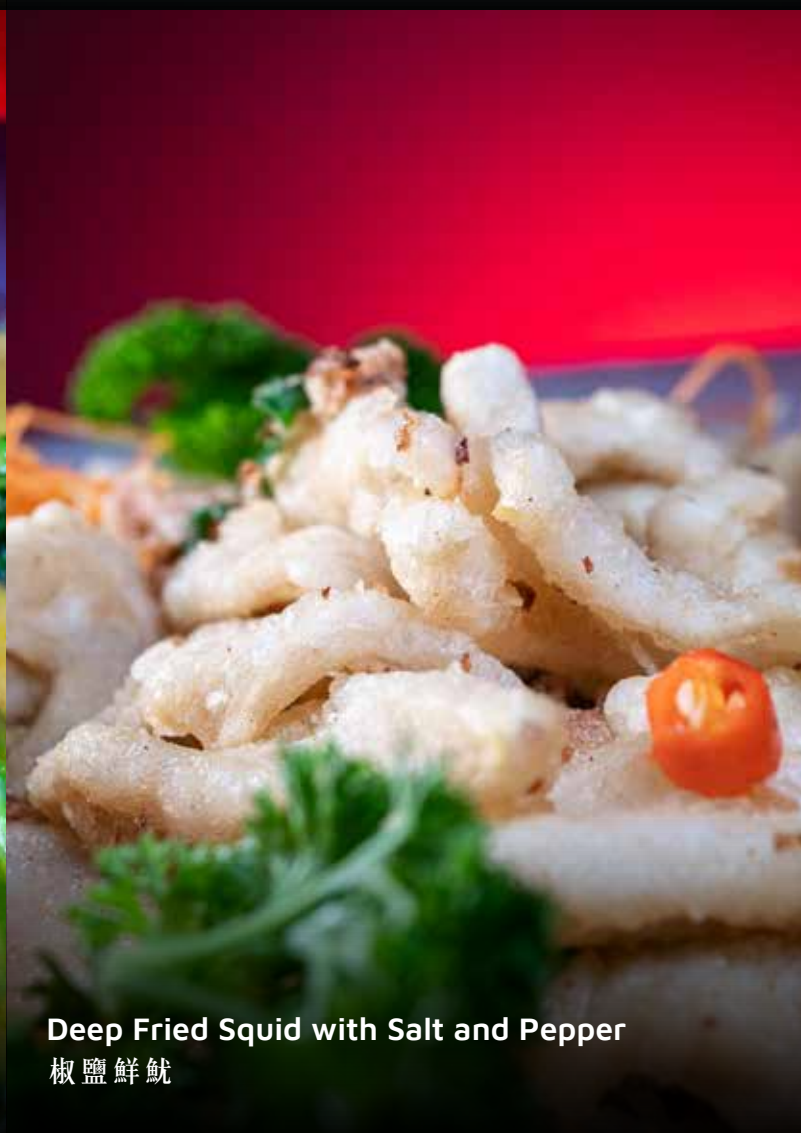
Deep Fried Squid with Salt and Pepper 椒鹽鮮魷