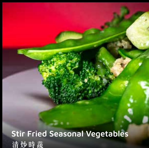
Stir Fried Seasonal Vegetables 清炒時蔬

Chinese Broccoli with Oyster Sauce $22.80 蠔油芥藍