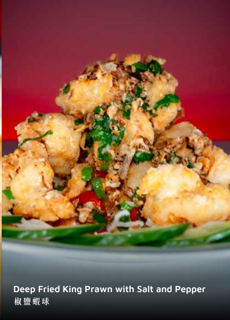
Deep Fried King Prawn with Salt and Pepper 椒鹽蝦球