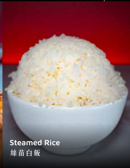
Steamed Rice 絲苗白飯