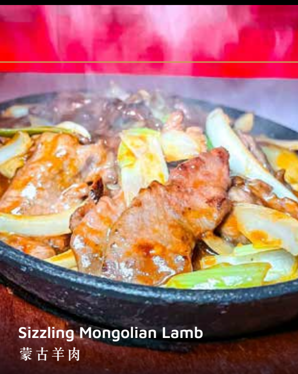
Sizzling Mongolian Lamb