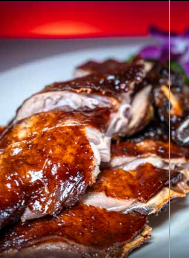
Roasted Duck with Plum Sauce 梅醬燒鴨