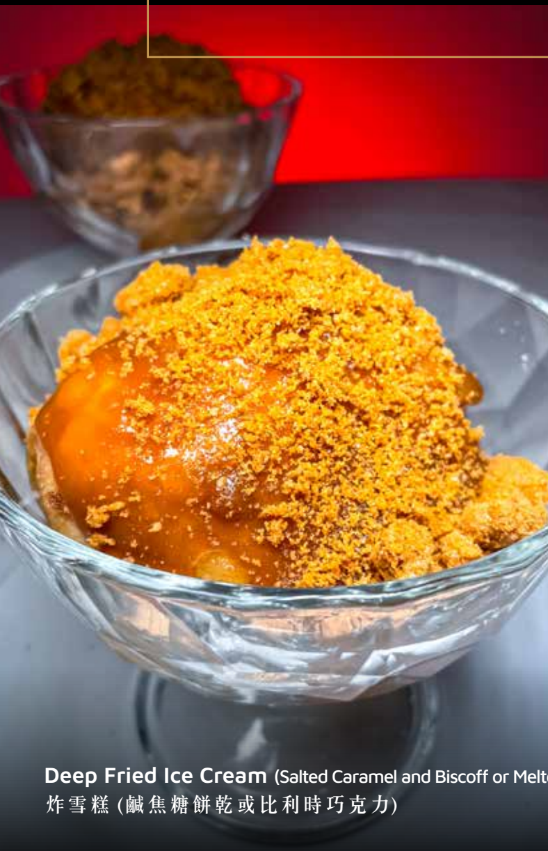
Deep Fried Ice Cream (Salted Caramel and Biscoff or Melted Belgian Chocolate) 炸雪糕 (鹹焦糖餅乾或比利時巧克力)