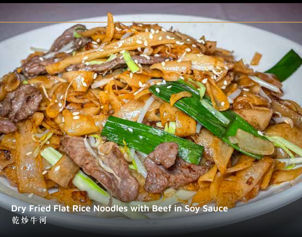
Dry Fried Flat Rice Noodles with Beef in Soy Sauce 乾炒牛河