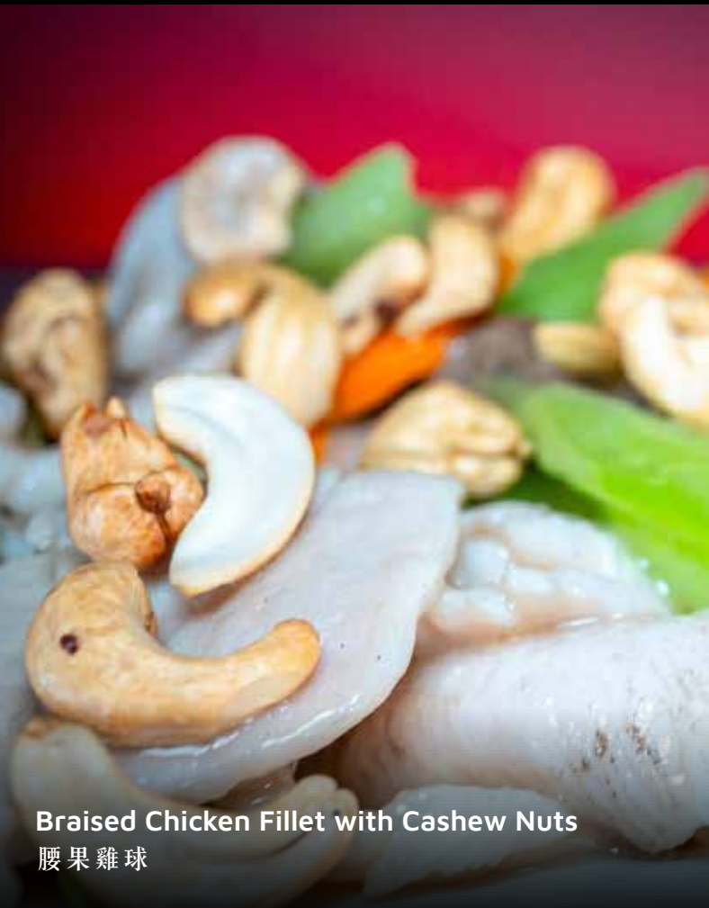
Braised Chicken Fillet with Cashew Nuts 腰果雞球